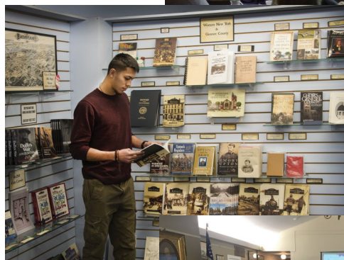
(Gift & Book Shop)